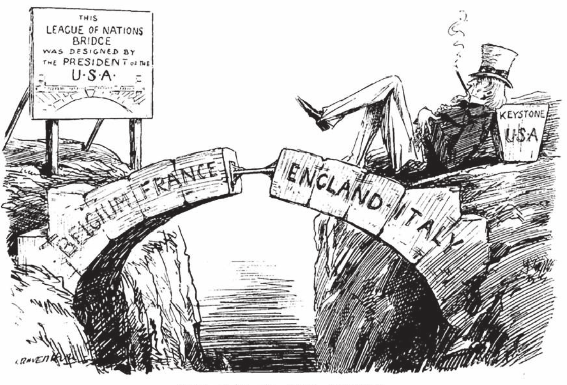
THE GAP IN THE BRIDGE.

A cartoon published in a British magazine, December 1919. The keystone is the stone that locks the structure together.